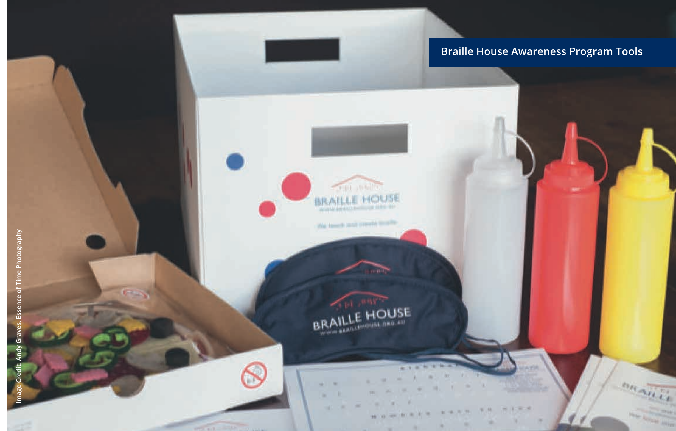
Braille House Awareness Program Tools